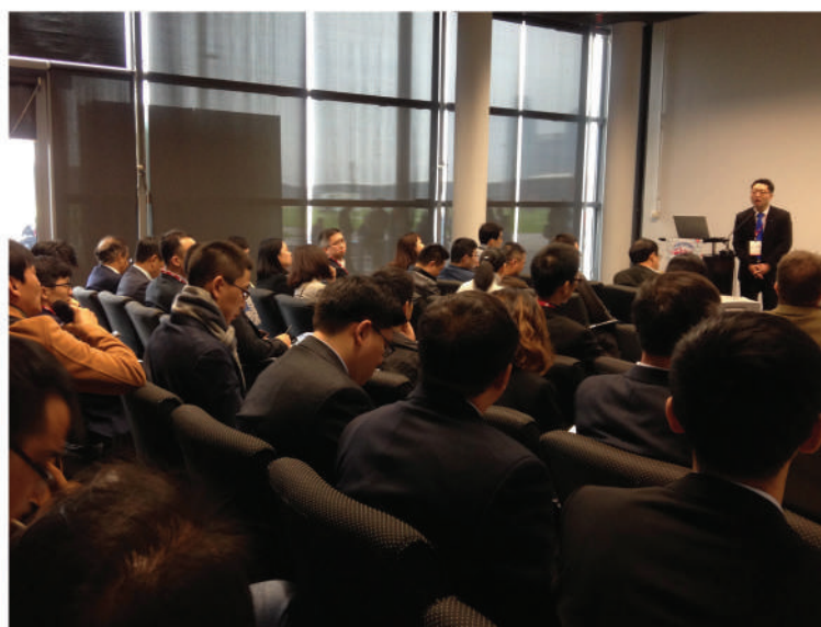
▲ TECHCROSS' "Installation of BWMS in the retrofit market" Seminar