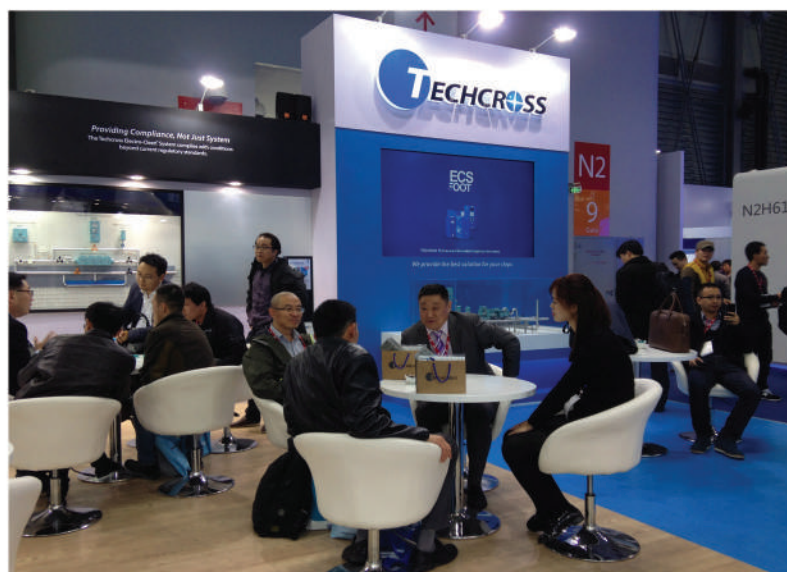
▲ TECHCROSS' stand at Marintec China 2015

In spite of maritime industry's recession, Marintec China 2015 recorded the most number of 60,000 visitors in the exhibition's history.